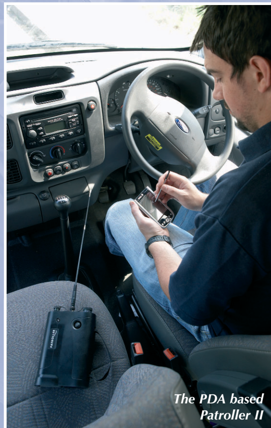
The PDA based Patroller II